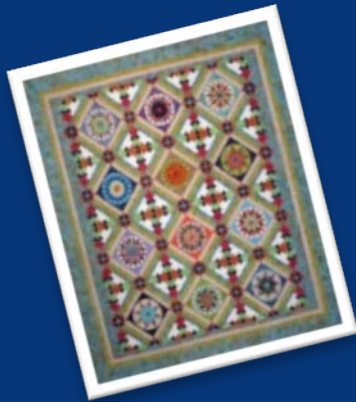
Winner of 2014 Donation Quilt Peg Burrell