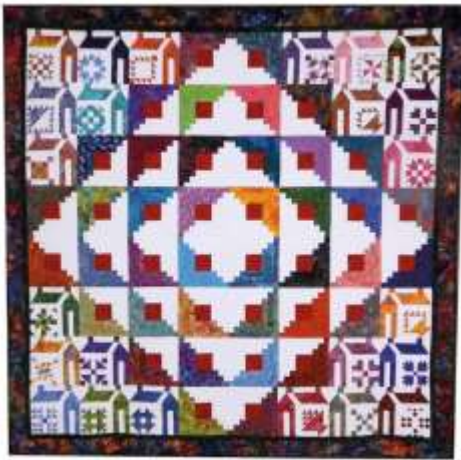
“Homeward Bound” Size 80 X80