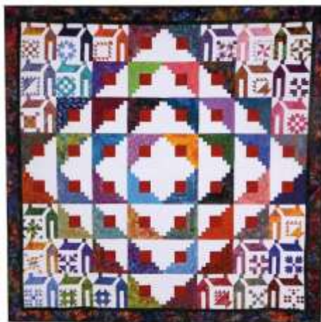
"Homeward Bound" Size 80 X80