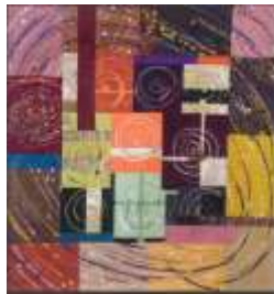
Enso II by Rickie Seifried. From the exhibit “On the Fringe.”

LA GRANGE, TEXAS – June 13, 2016 – For its next installation of exhibits, the Texas Quilt Museum is going on the fringe, staying in the square of tradition, and taking a little wild trip with its three new collections. They will be on display from June 30-September 25, 2016.