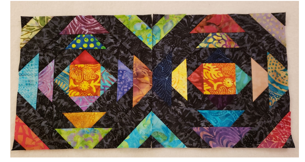
Kayleen Farrington's pineapple blocks