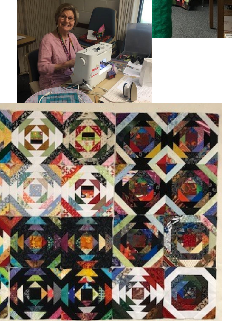
Our Class's completed pineapple blocks!