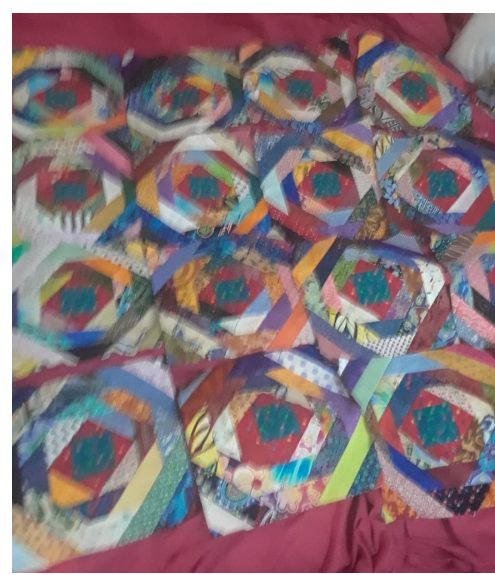
Kara Overman's pineapple blocks