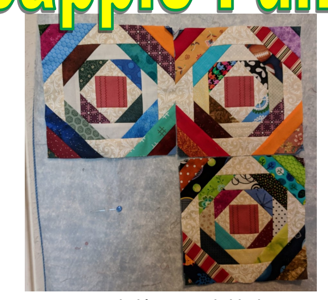
Joyce Clark's pineapple blocks