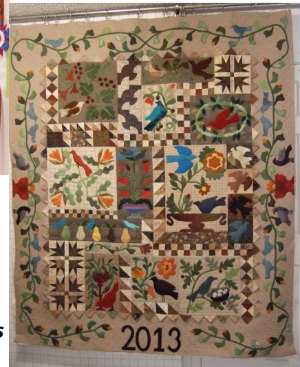
Fine Feathered Friends

All Guild meetings are held at the Bob Duncan Center, 2800 S. Center St., Arlington, TX 76014.