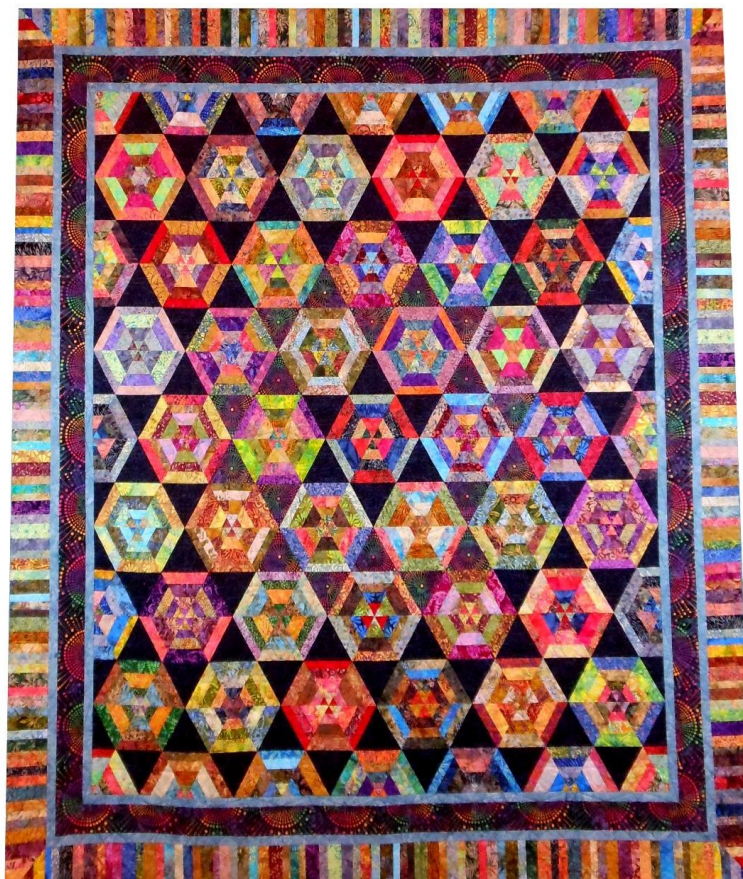
QGOA 2018 Donation Quilt "Webs of Color" 86" x 96"