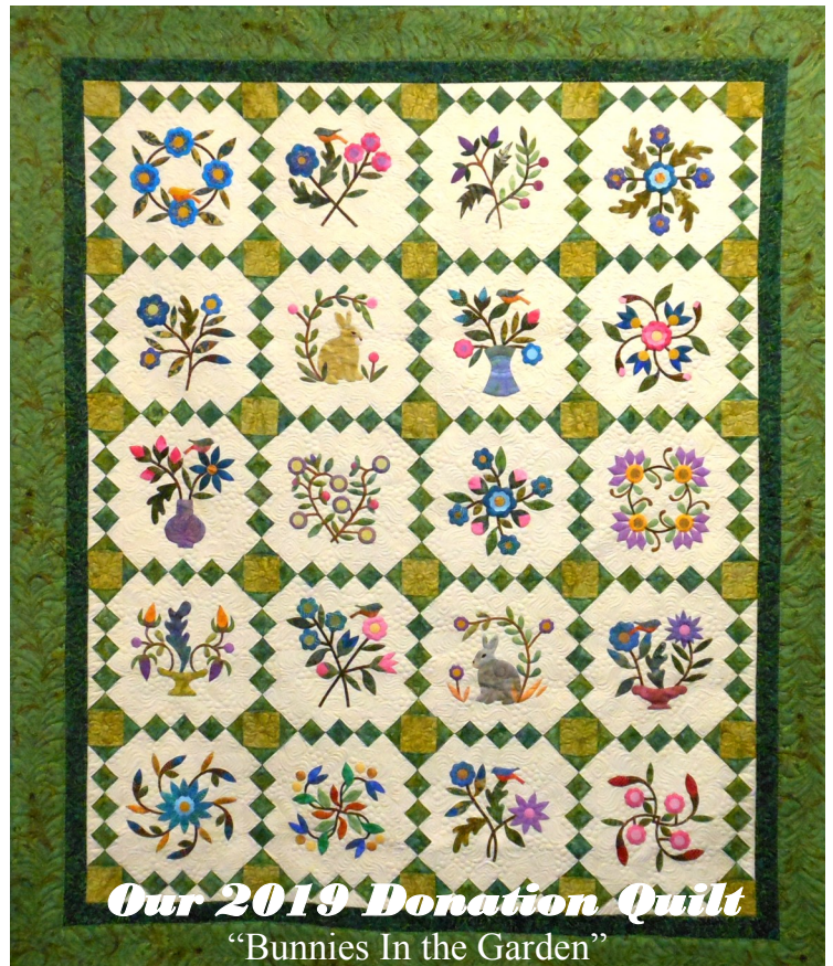
Our 2019 Donation Quilt

At the July meeting we will be exchanging Christmas Charms . You will bring in as many 5" squares as you would like to exchange to the meeting. You will need to put them in a baggie, envelope, or such with your name and the number of included charms on it. I will sort and fill your bag with an equal number of charm squares for you to pick up at the end of the meeting.