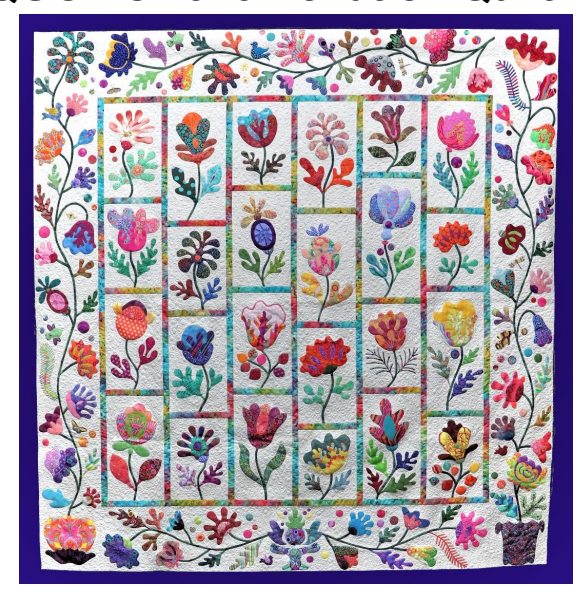
"Friends in My Garden" 83" X 91"

Donation quilt tickets are on sale; $1 each or 6/$5