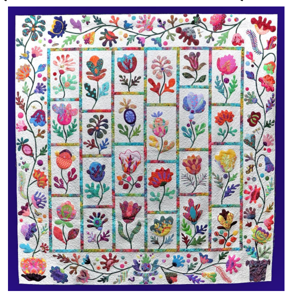
"Friends in My Garden" 83" X 91"