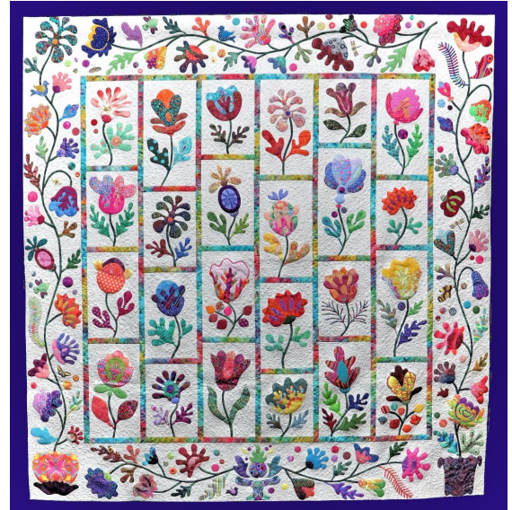
"Friends in My Garden" 83" X 91"