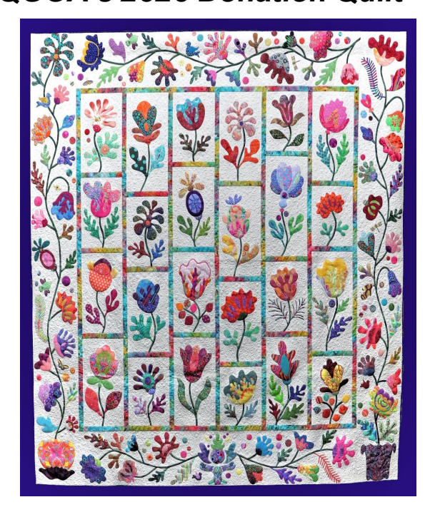
"Friends in My Garden" 83" X 91"

Calling all Members! How can you help us sell our 2020 Donation Quilt Tickets? Post our information on Your Social Media Sites!