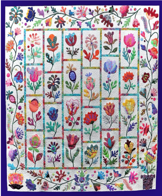
"Friends in My Garden" 83" X 91"

Calling all Members! How can you help us sell our 2020 Donation Quilt Tickets? Post our information on Your Social Media Sites!