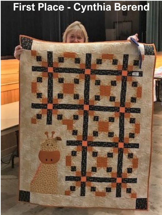
First Place - Cynthia Berend