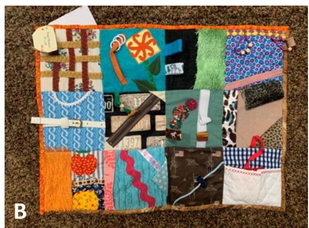
Fidget blanket A and B (perfect for an older person in assisted living with dementia; 18"x24")—Sale price $28 each Was $40 each

Butterfly Quilt (46"x50" beautiful quilting and appliqué) Sale price $70 Was $100