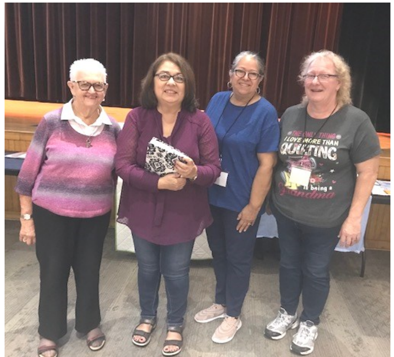
2023 Executive Board