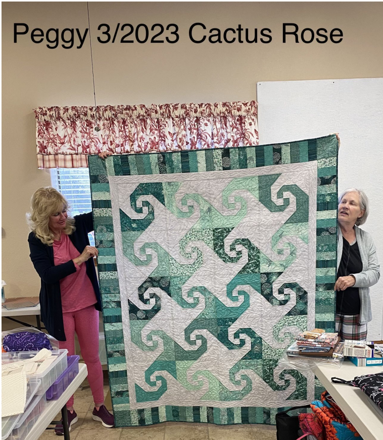
Peggy 3/2023 Cactus Rose