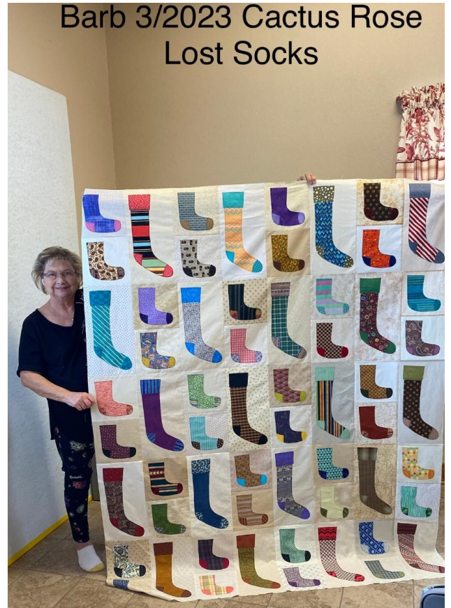
Barb 3/2023 Cactus Rose Lost Socks