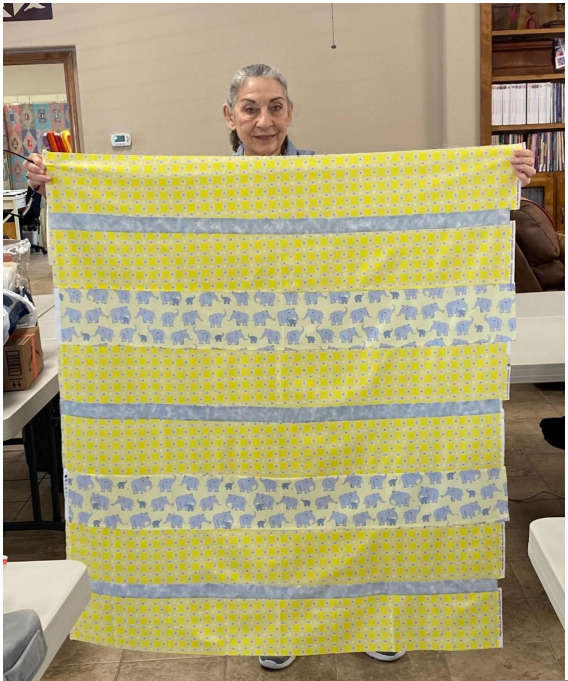
Randa 3/2023 Cactus Rose