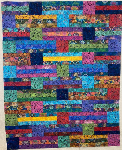
Dawn 3/2023 Cactus Rose