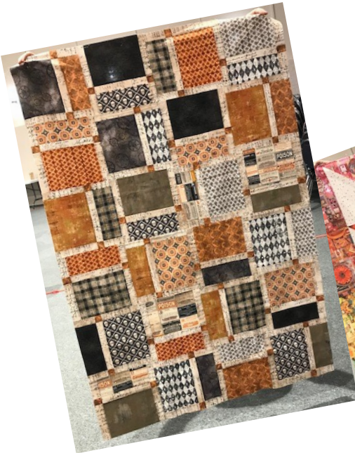
Debra Ware was able to complete several quilt tops!