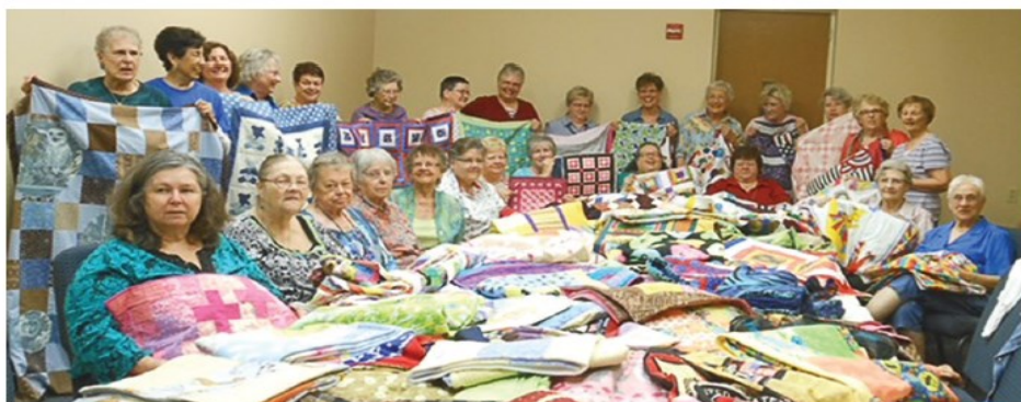
An historic photo of some of the original charter members with the myriad of quilts their stitch group, Friendship Stitchers, donated to the Linus Project and Ronald McDonald House during a single year.