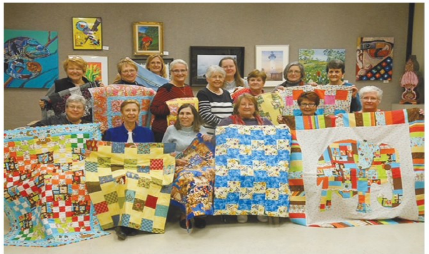
The Piecemakers stitch group displaying quilts they made in 2022 for donation to their charities.