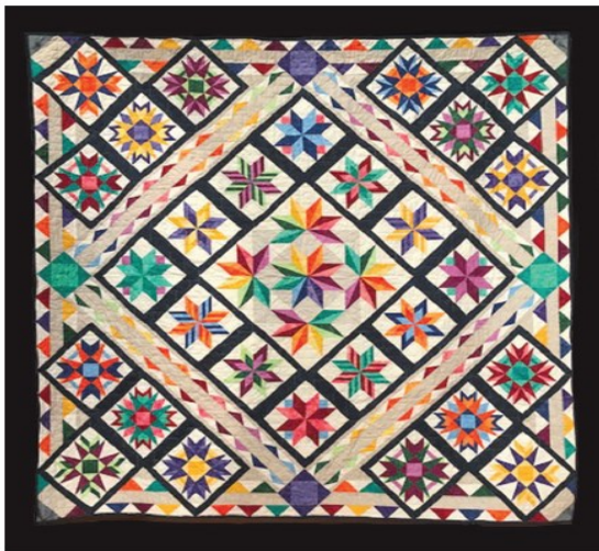
The beautiful quilt being raffled for the 2024 fundraiser.