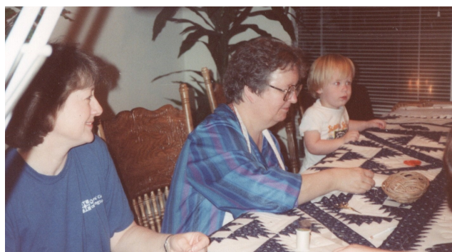
Working on 1990 Donation Quilt