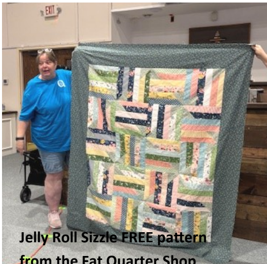
Jelly Roll Sizzle FREE pattern from the Fat Quarter Shop